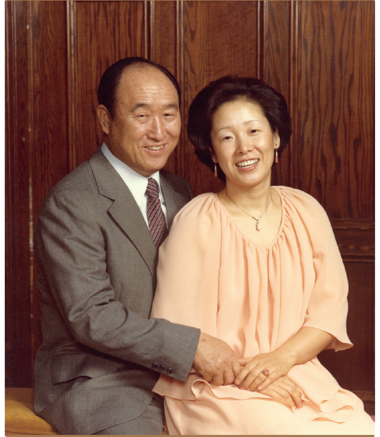
Rev. Dr. Sun Myung Moon · Dr. Hak Ja Han Moon